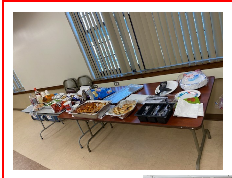
Sunday, February 18, 2024