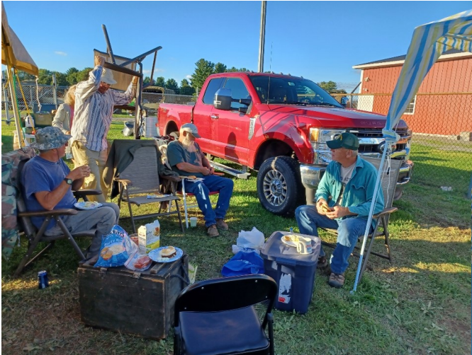
Sorry the cream puffs are all gone.

As the summer is coming to an end, several members of the chapter attended the Red Ball Show in Gilbert PA on Friday & Saturday, September 24th & 25th. They did have a challenge with set-up on Thursday due to the flash floods that pasted through the area that afternoon and early evening,. The weather turned out to be warm and sunny on Friday & Saturday making the show enjoyable by all. It was fun to be there with many friends and able to enjoy Friday evening dinner together at the show.