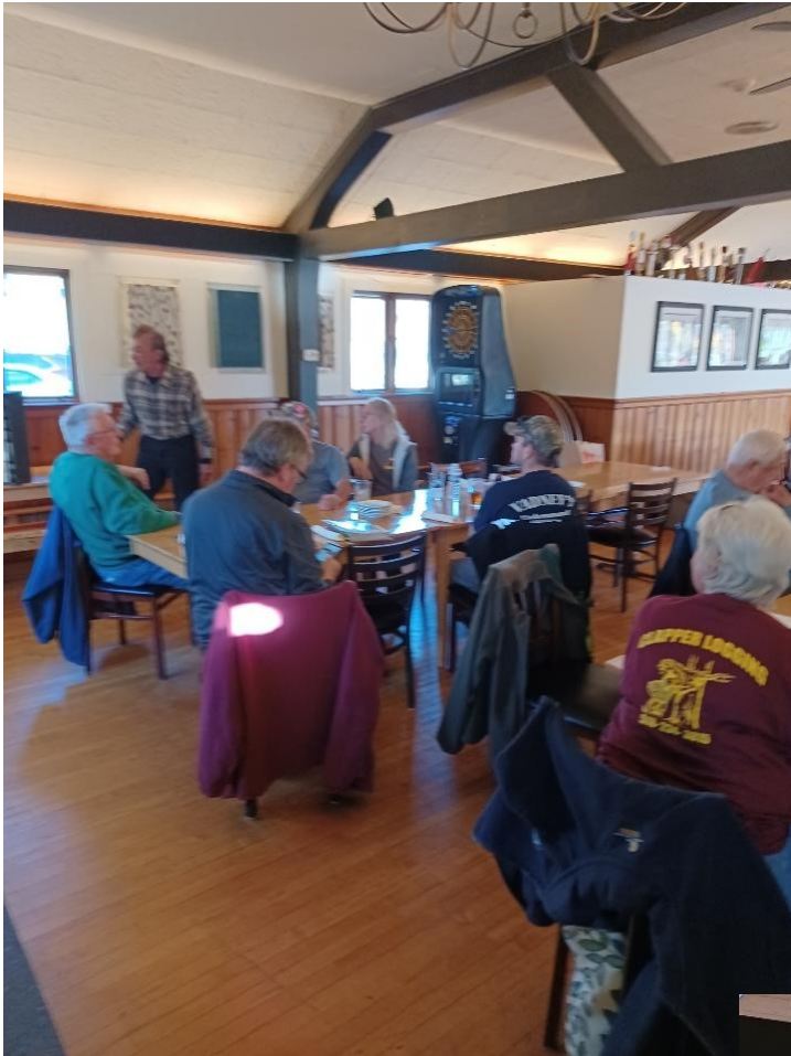
Hudson-Mohawk Chapter meeting November 7, 2021 at The Maples on the Lake, Warners Lake, NY