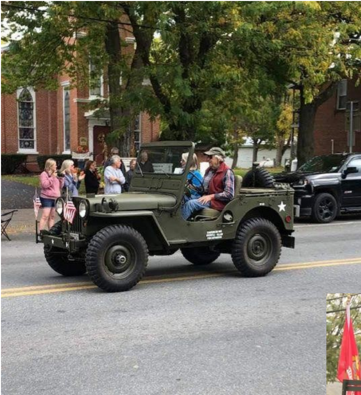
First Responders Parade (con't.)