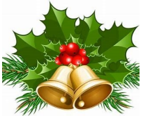
Hudson-Mohawk Chapter meeting on Sunday, December 7, 2021 at The Home Front Café, Altamont NY