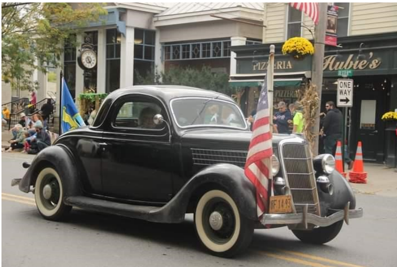
Saturday, October 9, 2021 members of the Hudson-Mohawk Chapter participated in First Responders Parade in Middleburgh, NY.

A member shared that a new Air Museum will be opening up as part of the Air National Guard at the Albany International Air Port, Albany NY. We hope to have more information regarding the possibility of a Wheels & Wings Show to be held in 2022.