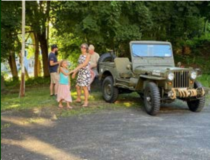
Many happy faces!

On June 20, 2022 several members of the Hudson-Mohawk Chapter attended the Gallupville Touch-A-Truck event. In addition to the military vehicles; Town Highway, Fire Department, and the County Sheriff's Department also had vehicles on display. This allowed the members of the Town to see these working vehicles along with the enjoyment of an ice cream social. All to benefit the Gallupville House.