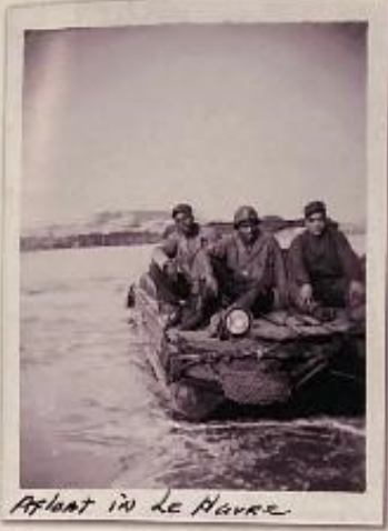
Afloat in Le Havre